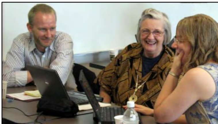
Elinor Ostrom (center) of LTRA-1 confers with co-PIs Krister Par Andersson and Ruth Meinzen-Dick.